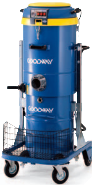
Triple-Motor Large Capacity Vacuum