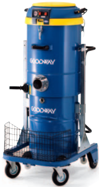
Twin-Motor Large Capacity Vacuum