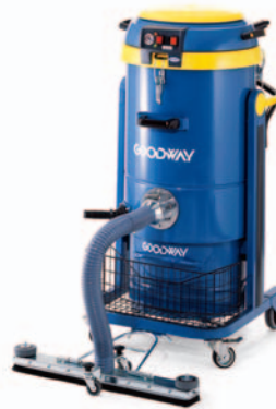
Twin-Motor "Walk Behind" Vacuum