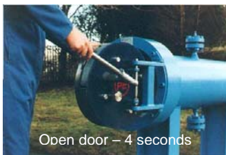
Open door – 4 seconds