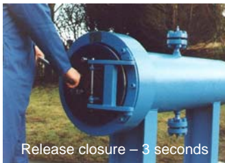
Release closure – 3 seconds